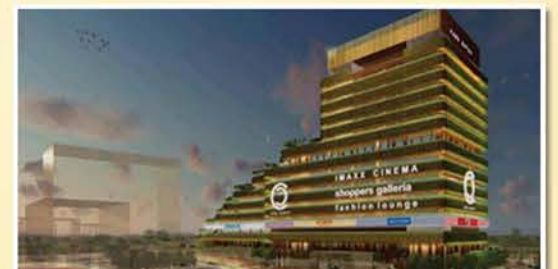
Multilevel Car Parking cum Commercial Complex at Agartala