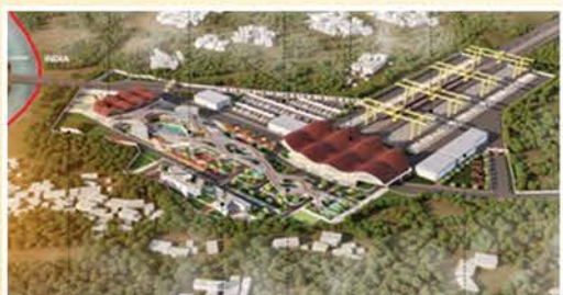
Integrated Check Post, Sabroom(LPAI)